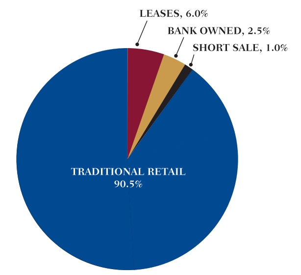
HISTORIC HOME SALE DISTRIBUTION

In our current Buyer's market, the type of home that is selling has shifted from the traditional profile of the past 20 years. It is therefore important to understand where your home fits into the overall market activity. Although traditional owner occupied homes make up a majority of the current homes available for sale, the majority of the homes being sold are bank owned or financial hardship related sales. This puts downward pressure on values and causes pricing to take a more significant roll in marketing. As a traditional seller, in order to stand out in a crowded field. (made even smaller by the Buyer's focus on bank owned) flexibility on pricing, terms, lease vs. sale, or lease to own becomes imperative.